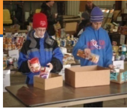
People In Crisis