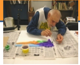
Promoting Self Sufficiency