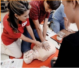
Strong & Healthy Communities