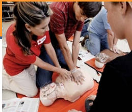
Strong & Healthy Communities