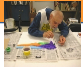
Promoting Self Sufficiency