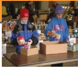
People In Crisis